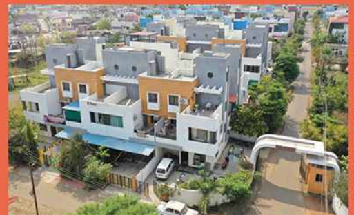
MAHARANA NAGAR - 1

This brochure is only a conceptual presentation of the project & not a legal offering. The promoters reserve the rights to add, delete or alter the above specification & plans as deemed fit. Images used are for representation purpose only.